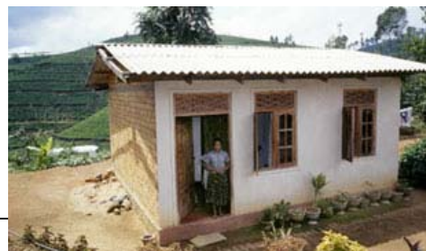
Typical example of a Habitat for Humanity concrete block home. Tilt up home will be similar in size and finish.

BWB will be responsible for building the first five "prototype" homes, instructing local labour on this new panel and home construction process. This will ensure skills are gained within the community, providing more opportunities and independence for the local people.